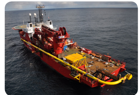
Subsea construction services